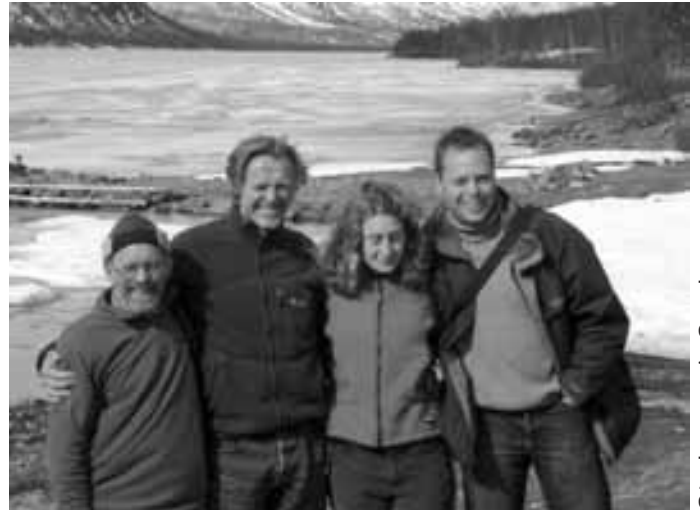
Study group in Sweden