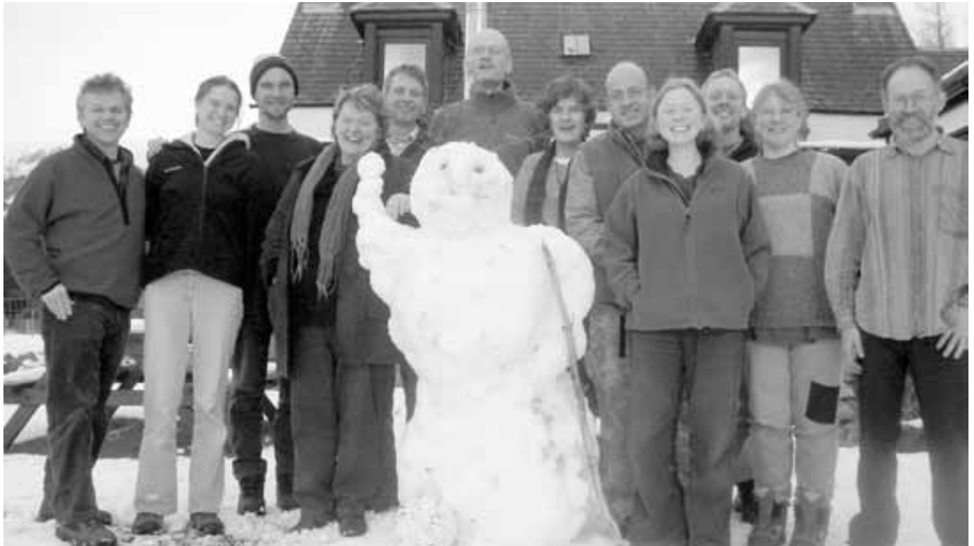
Staff and directors on retreat at Glenfeshie

Reforestation Scotland supports the restoration of Scotland’s landscape through communities managing their local woodlands, encouraging the regeneration of damaged habitats and promoting opportunities for forest-based rural development.