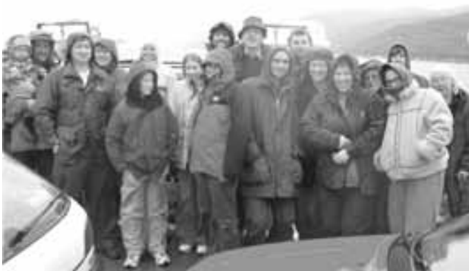
Drenched people on the way to Dunbeag