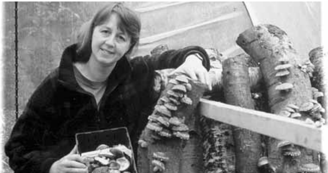
Mushrooms: one of the many non timber forest products