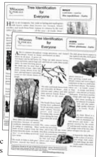
2 of the 22 Tree ID Sheets

The Tree ID Pack containing leaflets, tactile illustrations and a CD was launched in Autumn of 2004 at four ceremonies around the country: Paisley in Renfrewshire, Munloch North of Inverness, Glen Nevis near Fort William, and Townhill Wood in Fife. The Pack has been widely distributed free of charge, and has since become available at a small charge. There is great scope for development through technology but also through revival of the ‘identification through the senses’ workshops we held early on. Work on improving electronic access on the CDs is continuing.