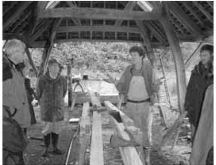
Timber building explained at Barnluasgan

also contributed to the Forestry Debate at the Scottish Parliament, providing guidance to both the Green and Scottish Socialist parties.