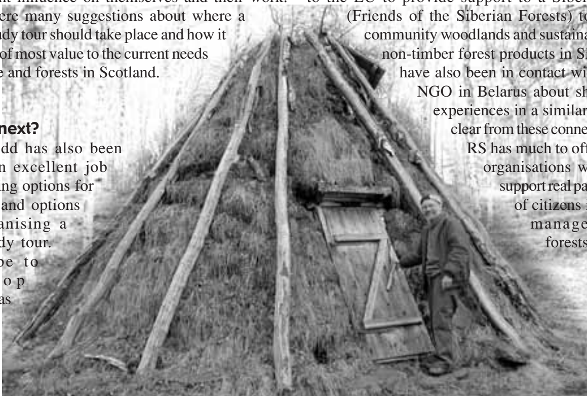
Les checks out a Sami dwelling

Through our involvement in Sweden and with the GCCBFM network further opportunities to support community forest development in other countries have developed. In June we resubmitted a proposal to the EU to provide support to a Siberian NGO (Friends of the Siberian Forests) to develop community woodlands and sustainable use of non-timber forest products in Siberia. We have also been in contact with a small NGO in Belarus about sharing our experiences in a similar way. It is clear from these connections that RS has much to offer similar organisations working to support real participation of citizens in use and management of forests.