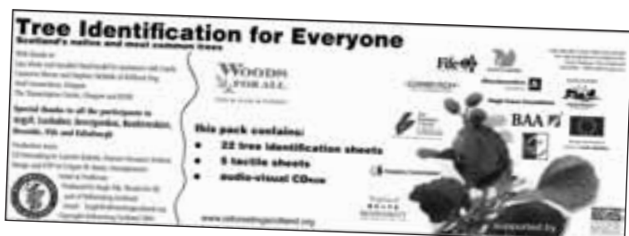
Folder cover for Tree ID pack

As part of the successful Tree Identification for Everyone project, the “Tree ID resource pack” was launched this year. This is an incredible interactive resource that allows people to identify trees from leaves, bark and other features, from both pictures and spoken descriptions – and it has proved very popular.