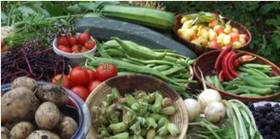
An afternoon's harvest in our Forest Garden.

Please ask for more information. We are happy to give free advice on all serious enquiries so that you get the garden you really want, and the knowledge to maintain it.